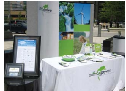
BULLFROGPOWER EMPLOYEE/TENANT EDUCATION